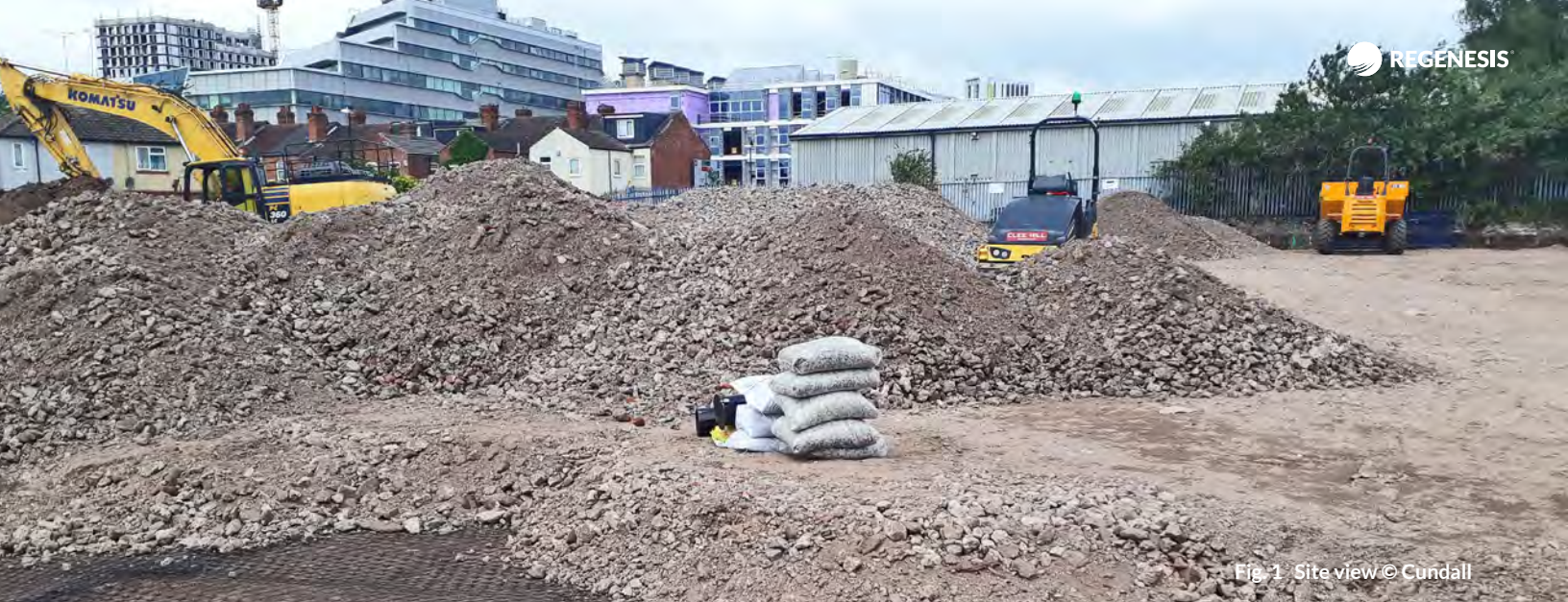
Fig. 1 Site view