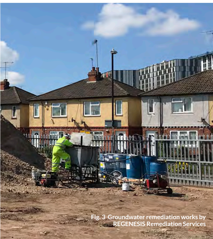
Fig. 3 Groundwater remediation works by REGENESIS Remediation Services

The process was repeated, coating the subsurface soil matrix and transforming the soils at the edge of the site from an impacted aquifer into a purifying filter. Once in place the PetroFix barrier immediately began sorption and biological degradation of the contaminant influx.