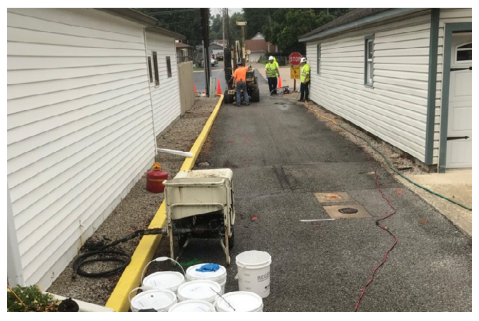
Workers applying amendments at IP-10 in July 2017

Wilcox and REGENESIS communicated with the nearby community throughout the application process in order to address noise and driveway access. During the pilot test, 4,000 lbs. of PlumeStop, 400 lbs. of HRC, and 18 liters of BDI Plus were injected using a direct push method under low pressure into 35 injection points. In addition, a secondary co-reagent was applied to optimize distribution of the PlumeStop within the tight confines of the injection area and aquifer setting.