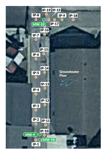
Map depicting injection locations