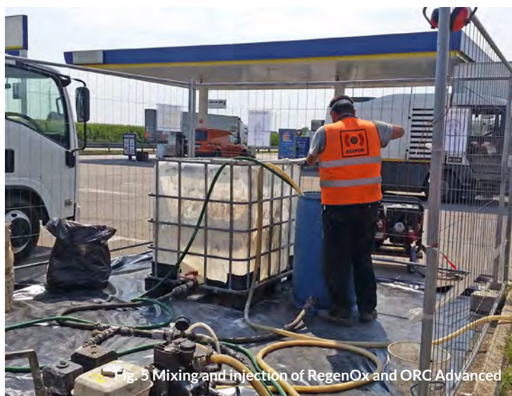
Fig. 5 Mixing and injection of RegenOx and ORC Advanced