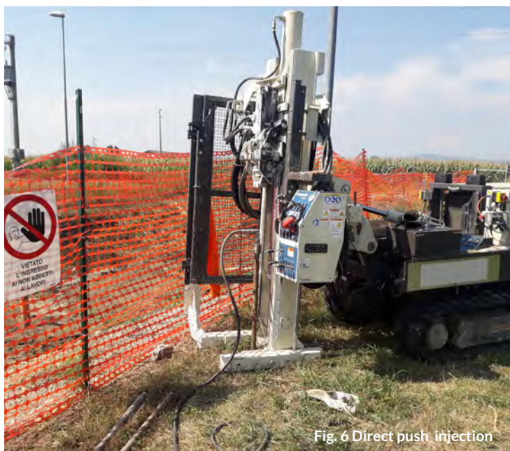
Fig. 6 Direct push injection