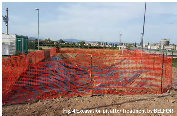
Fig. 4 Excavation pit after treatment by BELFOR

In the downgradient area, lower concentrations of contamination meant that only ENA was required. Here, ORC Advanced was injected into 10 direct push locations. The ORC Advanced was co-applied with ORC Primer , which provided a short-term (1-3 month) release of oxygen to create aerobic conditions in the aquifer more rapidly, after which ORC Advanced maintained the long-term treatment needed to reach low concentrations.