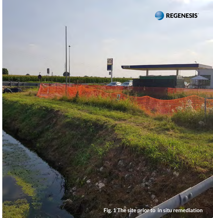
Fig. 1 The site prior to in situ remediation

A site investigation was completed concurrently with the oil-spill response in order to identify the subsurface contamination, build an initial Conceptual Site Model (CSM) and develop plans for remediation. MTBE, petroleum hydrocarbons (TPH) and BTEX were found to be within the soil – concentrated within the capillary fringe.