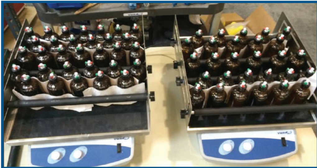
FIGURE 1 Batch-Equilibrium Study – Experimental Set-up

Benzene was quantified in the aqueous phase and also as a mass-balance extract of the total soilwater system (i.e. the aqueous and solid-phase microcosm contents together).