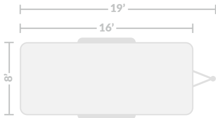
Overhead view of injection trailer dimensions

REGENESIS Remediation Services (RRS) injection trailers are manned by experienced field scientists and mobilized to every site equipped with: