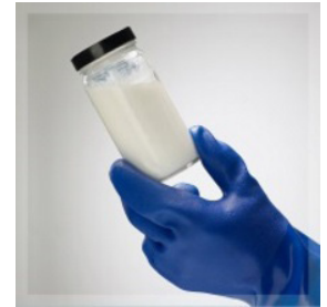
Example of 3-D Microemulsion

For a list of treatable contaminants with the use of 3DME, view the Range of Treatable Contaminant Guide .